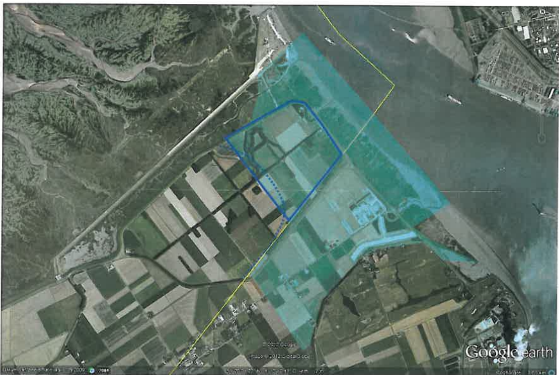
Tentative plan area for small Hedwige (dark blue line) polder and Prosper polder – a curved trajectory for the SW dike (dotted line) should be considered during the design

In line with the plan area for the combined Hedwige and Prosper polder development, a larger plan area for the combined small Hedwige and Prosper polder development has to be considered. In addition to the small Hedwige, the plan area includes the northern part of the Sieperda salt marsh, the salt marshes along to the Western Scheldt and the Prosper polder and its dikes. The salt marshes along the Western Scheldt will be affected, as the dikes will be removed, lowered or breached (depending on the implementation variant) and thus water flows will change. The salt marshes will be partly removed to allow the tide to inundate the area.