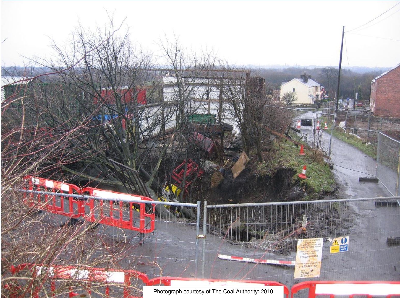
Photograph courtesy of The Coal Authority: 2010