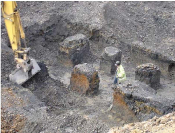
Pillars of coal being extracted as part of ground works: prevents sterilisation and effective method of remediating unstable ground caused by former coal workings