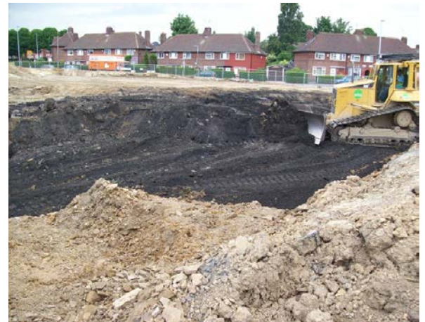
Coal close to the surface being extracted as part of ground works: prevents sterilisation and effective method of remediating unstable ground caused by former coal workings

Outcrop of coal close to the surface which would be sterilised without prior extraction and has the potential to cause instability for surface development