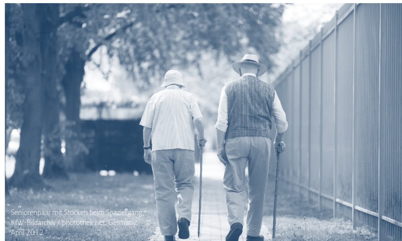
Seniorenpaar mit Stöcken beim Spaziergang, KfW-Bildarchiv / photothek.net, Germany, April 2012

Currently, solutions for instant payments at the point of interaction are regional or national and lack interoperability. The Next CMU Group therefore recommends the EU and the Member States to promote and support efforts to find a true pan-European solution.