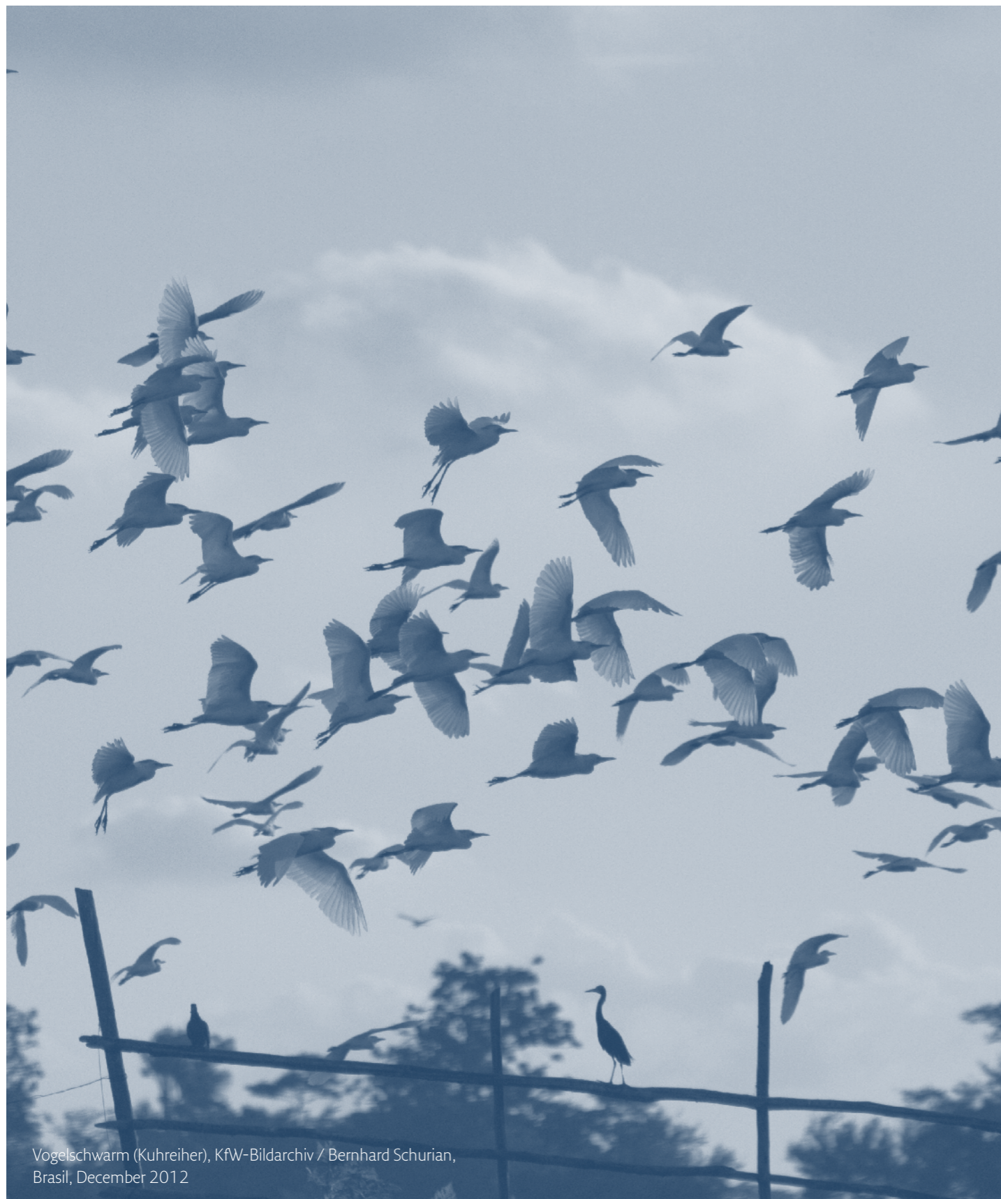
Vogelschwarm (Kuhreiher), KfW-Bildarchiv / Bernhard Schurian, Brasil, December 2012