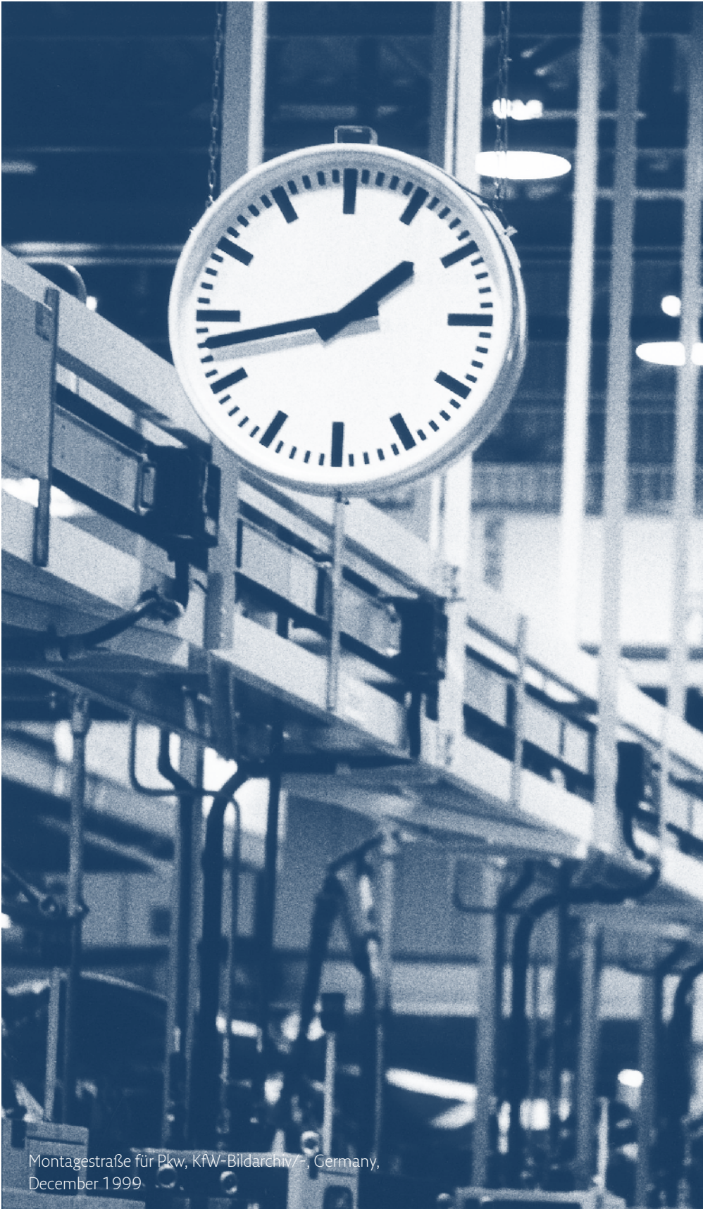
Montagestraße für Pkw, KfW-Bildarchiv/-; Germany, December 1999