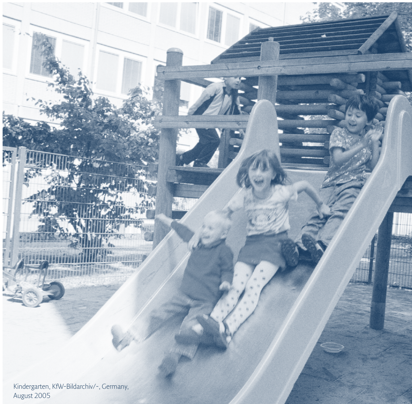
Kindergarten, KfW-Bildarchiv/-, Germany, August 2005