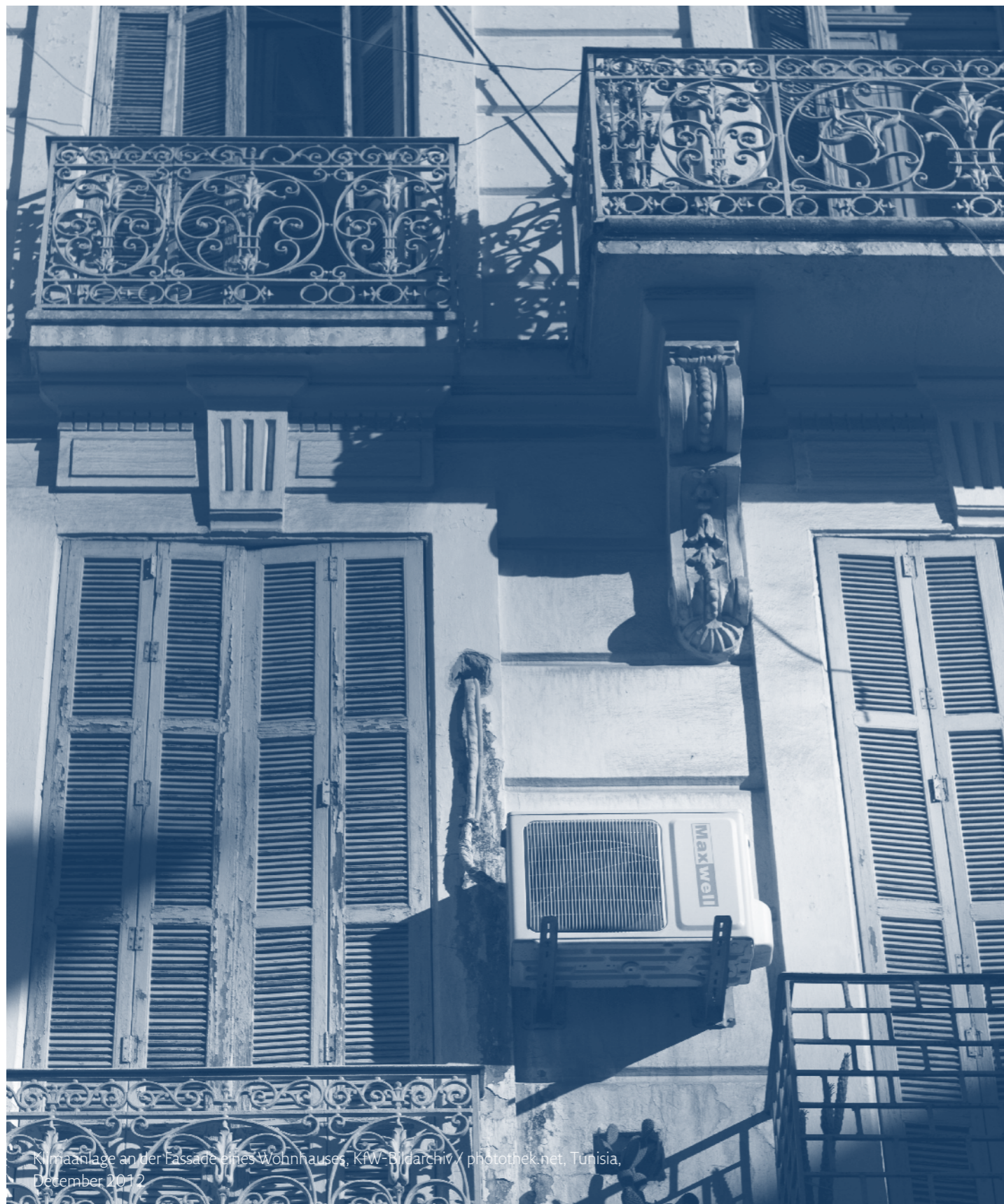
Klimaanlage an der Fassade eines Wohnhauses, Tunisia, Dezember 2012