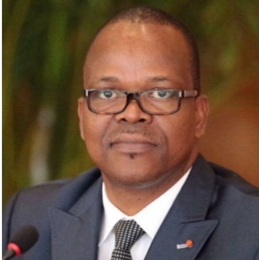
Alain Lobognon, Twitter

Decision adopted unanimously by the IPU Governing Council at its 206 th session (Extraordinary virtual session, 3 November 2020)