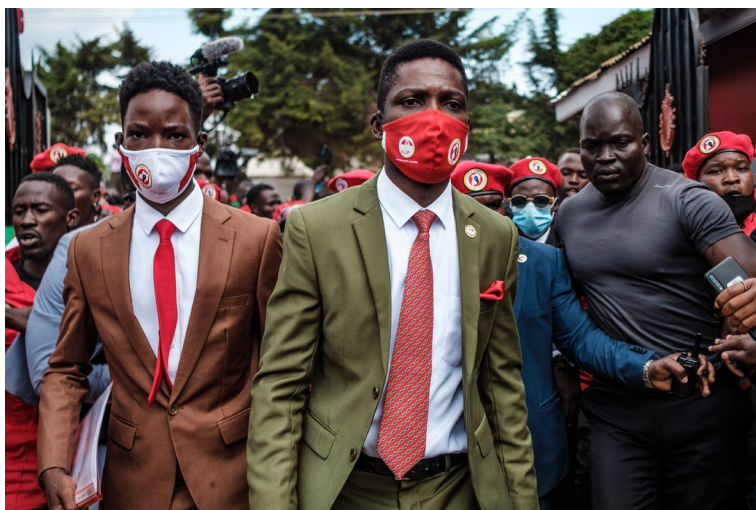
Mr. Robert Kyagulanyi, aka Bobi Wine, arrives at the headquarters of his political party in Kampala, Uganda, on 21 August 2020.

Decision adopted unanimously by the IPU Governing Council at its 206 th session (Extraordinary virtual session, 3 November 2020)