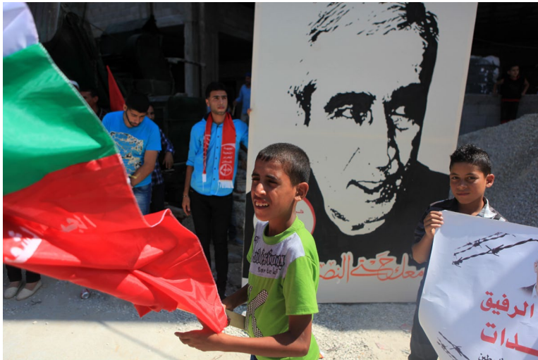
Palestinian supporters of the Popular Front for the Liberation of Palestine (PFLP) take part in a protest outside the UNDP office calling for the release of Ahmad Sa'adat, leader PFLP, in Gaza city on 29 July 2015.

Decision adopted by consensus by the IPU Governing Council at its 206 th session (Extraordinary virtual session, 3 November 2020) 5