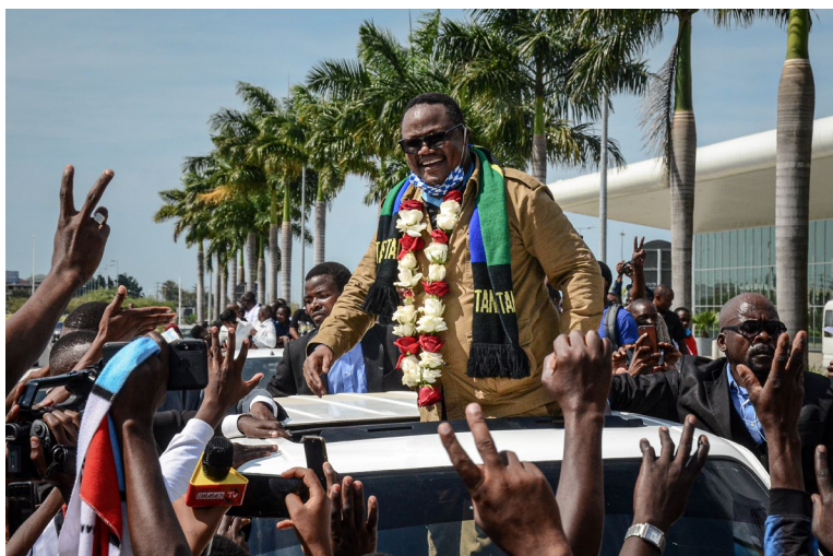
Mr. Tundu Lissu (centre), reacts to supporters upon his return on 27 July 2020 to Tanzania after three years in exile following a failed attempt on his life.

Decision adopted unanimously by the IPU Governing Council at its 206 th session (Extraordinary virtual session, 3 November 2020)