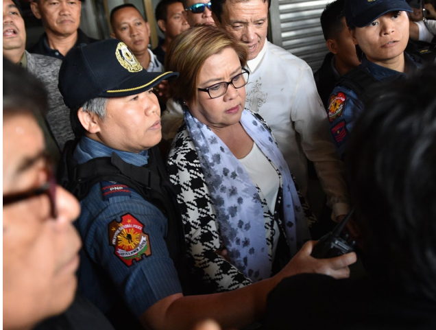
Philippine Senator Leila de Lima is escorted by police after her arrest at the Senate in Manila on 24 February 2017

Decision adopted unanimously by the IPU Governing Council at its 206 th session (Extraordinary virtual session, 3 November 2020)