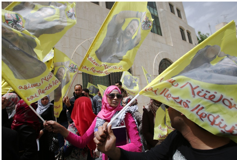
Ramallah, 15 April 2015 – Palestinian protesters wave flags bearing portraits of Fatah leader, Marwan Barghouti, during a march to mark the anniversary of his arrest.

Decision adopted by consensus by the IPU Governing Council at its 206 th session (Extraordinary virtual session, 3 November 2020) 4