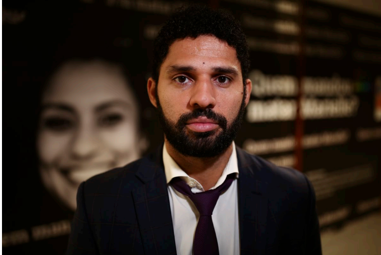
Brazilian member of parliament David Miranda of the Socialism and Freedom Party (PSOL) poses during an interview with AFP at his office of the National Congress in Brasília, on 5 November 2019.

Decision adopted unanimously by the IPU Governing Council at its 206 th session (Extraordinary virtual session, 3 November 2020)