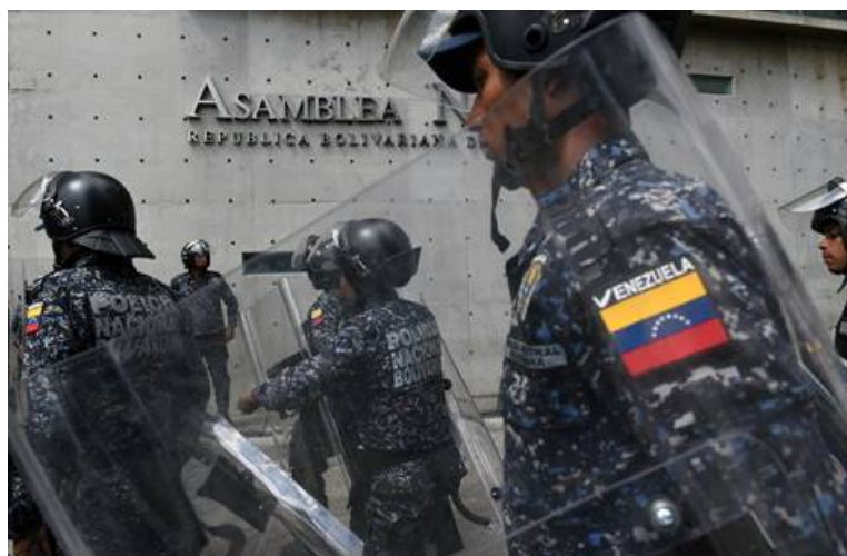
Venezuelan National Police members stand guard outside the National Assembly on 7 January 2020 in Caracas

Decision adopted unanimously by the IPU Governing Council at its 206 th session (Extraordinary virtual session, 3 November 2020)