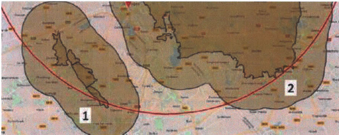
Figure 1 - areas for which subsidence and heave as cause of damage causes were investigated (areas outside circle numbered 1 and 2).

Chapter 1 presents the scope of the review. Chapter 2 elaborates on the review process used. It discusses the different parties involved, how the review was conducted and how the findings were combined into this report. Chapter 3 presents the details of the review. Lastly, chapter 4 summarizes the conclusions that can be made based on the results of the review.