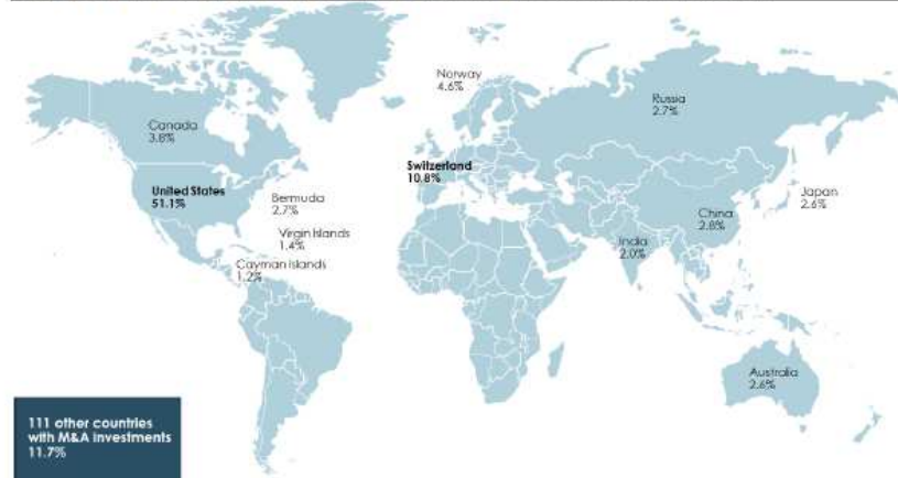
Figure 2.4 Origin of M&As towards EU Member States

Note: The period covers 2003-2016. Data were extracted in August 2017 and include confirmed transactions (number of M&As). The distribution is made on the number of investments, meaning that large transactions matter the same as other projects in this figure.