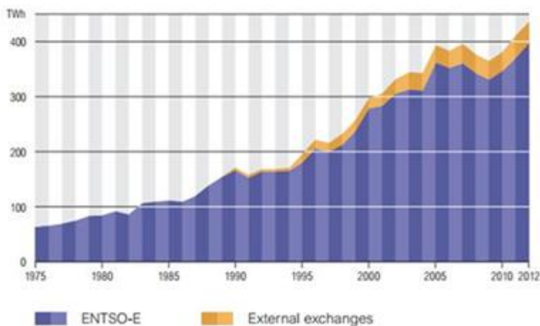
Development of overall cross-border exchanges of ENTSO-E member TSOs' countries since 1975

A more integrated market through interconnections also reduces the need for investment in peak generation capacity and storage because the plants that each country has would not be needed at the same time. This would result in substantial economic and political benefits in Member States due to reduced capital investments as well as to the reduction of the environmental impact due to the plants that would not be necessary to be built. Increasing the exchanges of the system balancing services also reduces the system short term operation costs. Lower generation costs and/or lower investments in generation and avoided fuel costs